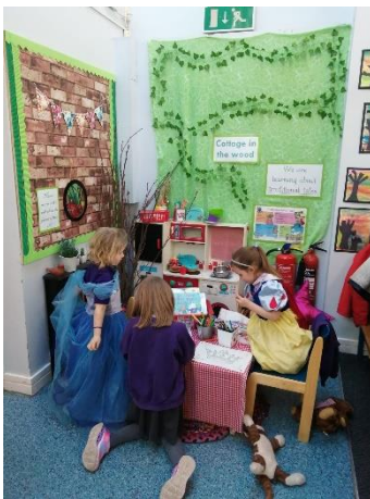
Y1 busy in the areas of provision.

Or email 37thstmikesbrownies@gmail.com for more information.