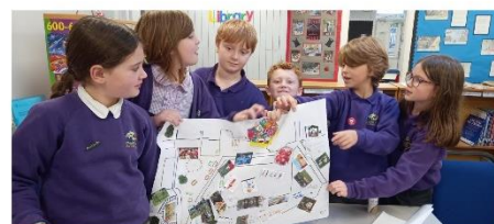
School Council working on their wishes for our school grounds.